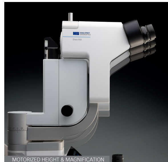
MOTORIZED HEIGHT & MAGNIFICATION

Additionally, Elara 900's motorized magnification changer enables seamless magnification adjustments directly from the joystick, delivering an uninterrupted diagnostic experience.