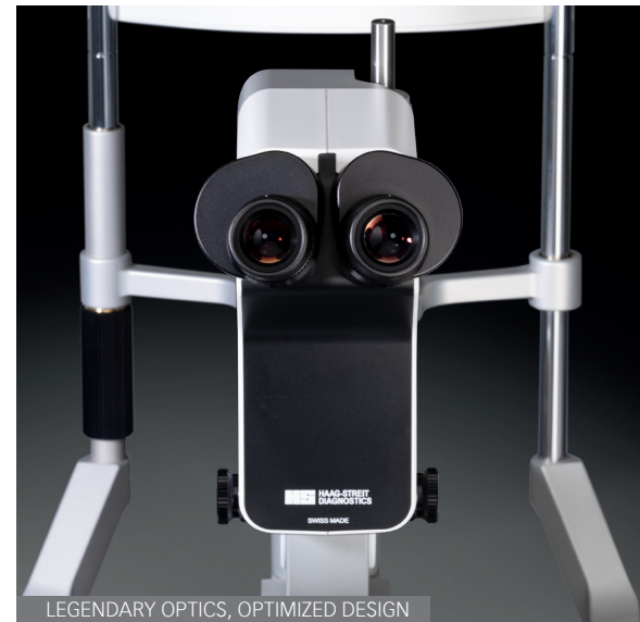
LEGENDARY OPTICS, OPTIMIZED DESIGN

Simply switch on the integrated, motorized yellow filter to increase contrast in specific areas – or select different lighting colors to optimize specific examination scenarios ("presets.")