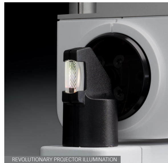
REVOLUTIONARY PROJECTOR ILLUMINATION

Elara 900's revolutionary projector light source ("P-Type") can emit colors across the entire visible spectrum, allowing different color temperatures to be selected for individual pathologies. Offering more illumination modes than traditional LED or halogen sources, the result is a high-resolution, high-contrast examination that aids in the identification of ocular structures. Infrared* illumination enables seamless Meibomian gland assessment, further boosting your workflow.