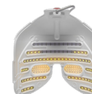
Reduces swelling & increases drainage