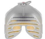
Reduces swelling & increases drainage