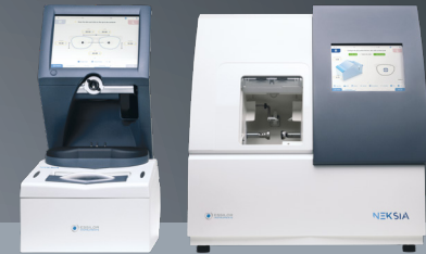
Mid-Range Neksia v2 Series

Since 1954, Essilor Instruments has been a pioneer in the finishing industry, offering robust and high-performing edging systems to boost your productivity and expand your capabilities.