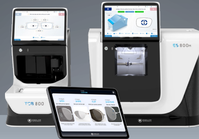
Premium ES 700/800 Series