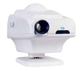
CS POLA 600