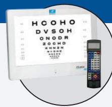
CHART SYSTEM CS POLA 600