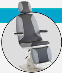
CHAIR RELIANCE 520