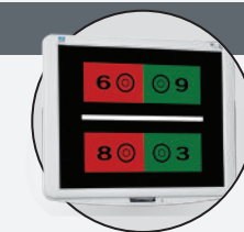
CHART SYSTEM CS 550