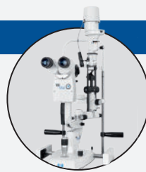
DIGITAL SLIT LAMP SL 550L