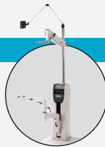
STAND RELIANCE 7900