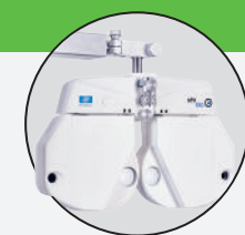
AUTOMATIC PHOROPTER APH 550