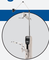
STAND RELIANCE 7900