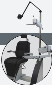
CHAIR & STAND 1800 CB