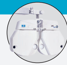
AUTOMATIC PHOROPTER APH 550