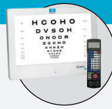
CHART SYSTEM CS POLA 600