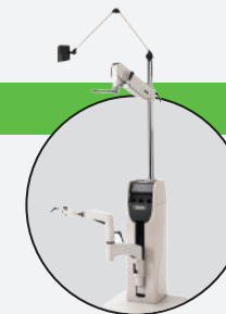
STAND RELIANCE 7900