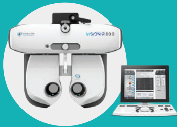
■ VISION-R™ 800 Refraction System