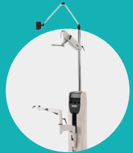
■ STAND Reliance 7900