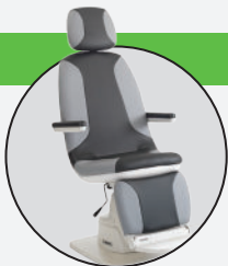
CHAIR RELIANCE 520