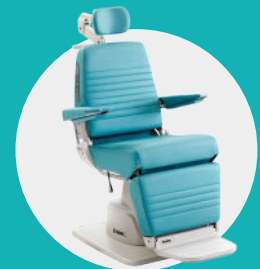
■ CHAIR Reliance 6200

Essilor Instruments is a global leader in the development of state-of-the-art optometric and ophthalmic equipment. Our goal is to provide practices the equipment and services that will meet their business needs and help them build relationships with patients.