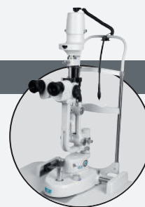
SLIT LAMP SL 350