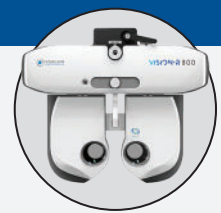
REFRACTION SYSTEM VISION-R™ 800