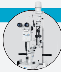
DIGITAL SLIT LAMP SL 550L