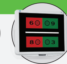
CHART SYSTEM CS 550