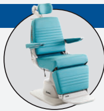
CHAIR RELIANCE 6200