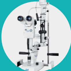
■ DIGITAL SLIT LAMP SL 550L