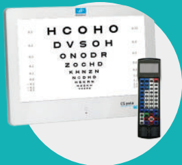
■ CHART SYSTEM CS POLA 600