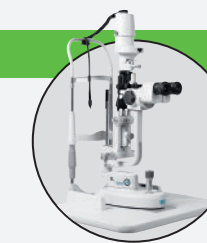
SLIT LAMP SL 450